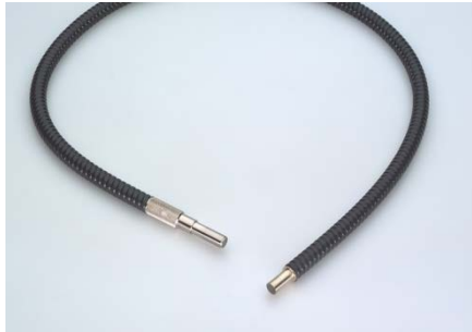
Flexible light guide single