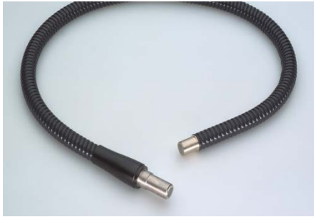
Flexible light guide for KL 2500 LCD